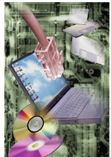
New year—new ideas!

This can be easily achieved by going to the site by typing this address in the address bar of your browser, clicking TOOLS, then clicking INTERNET OPTIONS, then clicking the USE CURRENT check box, next click APPLY and finally click OK.