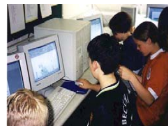
support for schools in the appropriate use of ICT