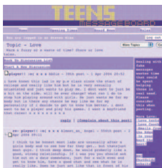
A message board

“Never accept emails from people you don't know. Don't open any attachments as they may contain viruses”