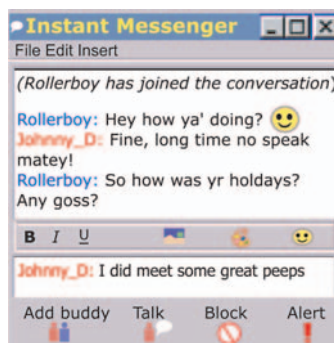
An instant messenger