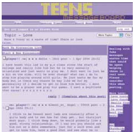
A message board