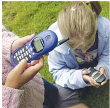
Mobile phone texting